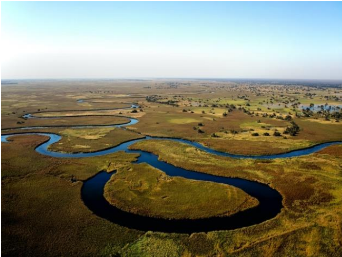
Figure 2: Okavango Delta, Botswana

Water resources are limited to wetlands, ephemeral and perennial rivers as well as water stored in reservoirs. The perennial rivers (Chobe, Limpopo, Zambezi and Okavango) are shared watercourses, of which their management and use are subject to the Southern African Development Community (SADC) Protocol on shared watercourses.