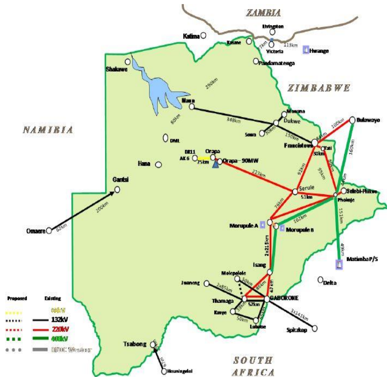
Figure 4: Transmission and distribution network.

The current trend towards 2030 indicates that 200,000 households will still be without electricity access in 2030 while 300,000 households will be without access to clean cooking. As a result, policy objectives such as Vision 2036 are focusing on ensuring improved security and reliability of energy supply to all sectors of the economy.