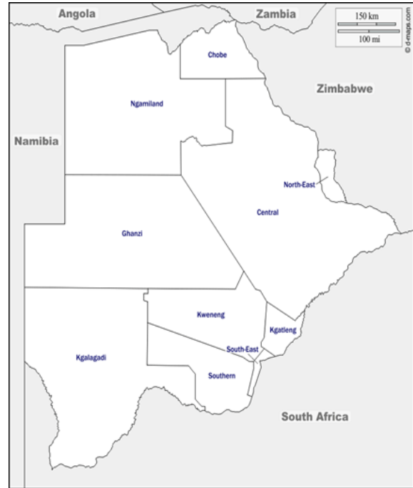
Figure 1 Map of South Africa.

Botswana is a democratic, multi-party republic, with the president of Botswana being both head of state and head of government. For the past five decades, the developmental focus has been centred on four key pillars: Sustainable Environment, Rapid Economic Growth, Economic Independence and Social Justice. Through focused improvement within these four key areas, Botswana has set itself a target of becoming a high-income country by 2036.