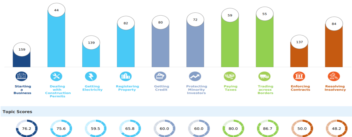
Figure 3: World Bank doing business 2020 global rankings and scores for various 'Doing Business' topics in Botswana.

Figure 3 provides the ranking and scores of Botswana compared to other economies for various 'Doing Business' topics, showing areas where Botswana is performing well and those that need to be improved. Access to electricity and enforcing contracts are the biggest areas of weakness for Botswana, which negatively impact doing business within the country and therefore limit business development.