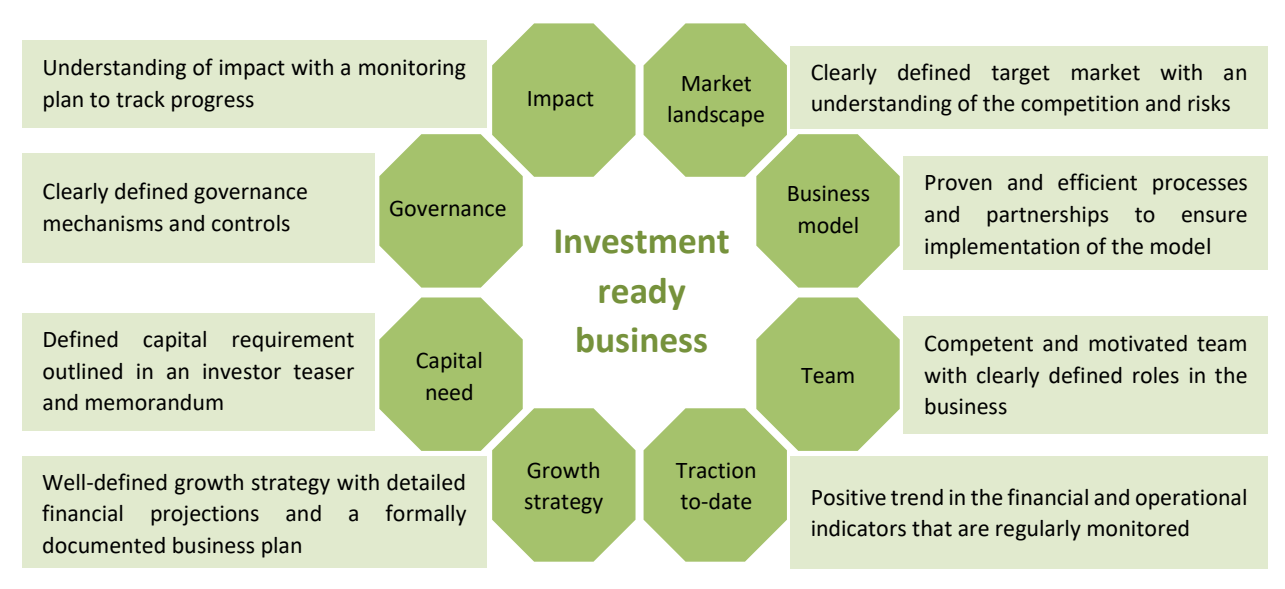
Figure 2 Example of an investment ready business

A business may consider itself investment ready when it can demonstrate that it meets the criteria, as displayed in Figure 3, with supporting documentation readily available in a company data room.