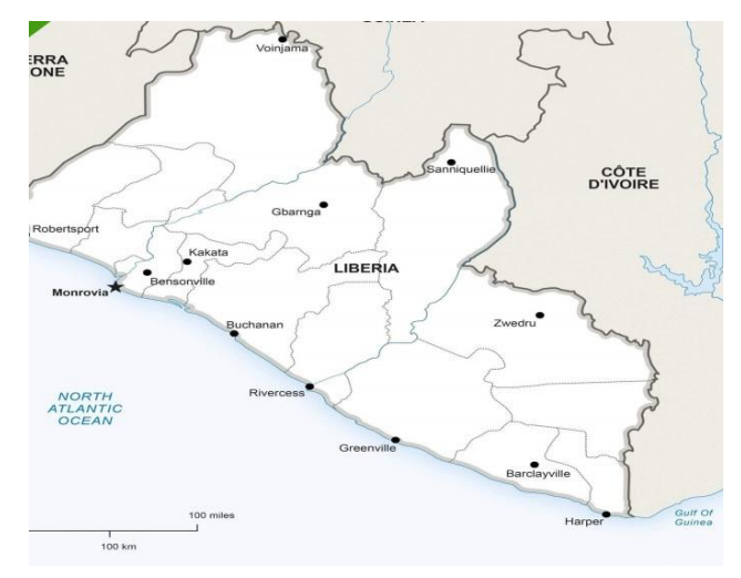
Figure 1: Map of Liberia.

Liberia held its third post-war general election in 2017 which saw George Weah, a former soccer star, win the presidential election in a run-off and inaugurated on January 22, 2018.